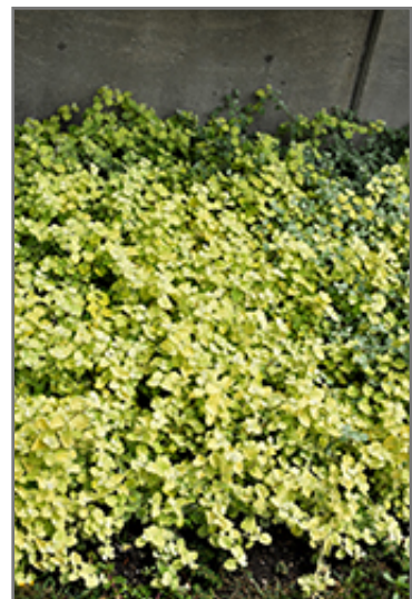
Lemon Licorice Plant