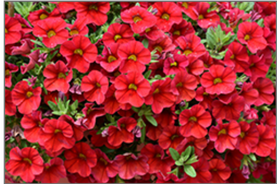
Superbells Red Calibrachoa flowers

Superbells Red Calibrachoa is recommended for the following landscape applications;