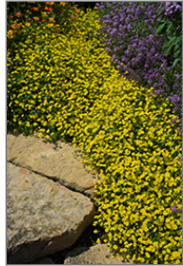
Gold Dust Mecardonia in bloom

Gold Dust Mecardonia is recommended for the following landscape applications;