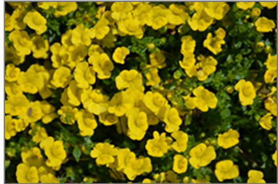
Gold Dust Mecardonia flowers

Gold Dust Mecardonia will grow to be only 4 inches tall at maturity, with a spread of 15 inches. When grown in masses or used as a bedding plant, individual plants should be spaced approximately 12 inches apart. Its foliage tends to remain low and dense right to the ground. Although it's not a true annual, this fast-growing plant can be expected to behave as an annual in our climate if left outdoors over the winter, usually needing replacement the following year. As such, gardeners should take into consideration that it will perform differently than it would in its native habitat.