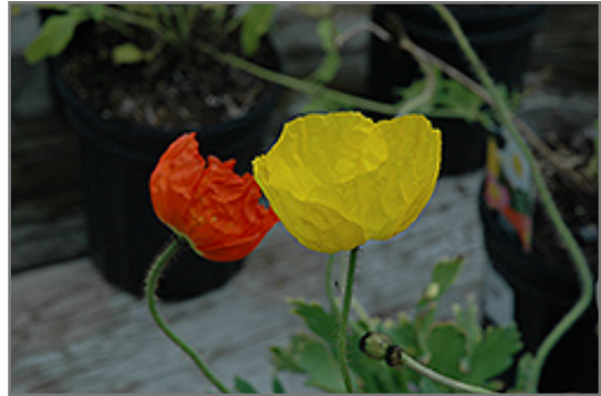
Wonderland Mix Poppy flowers

Wonderland Mix Poppy is recommended for the following landscape applications;