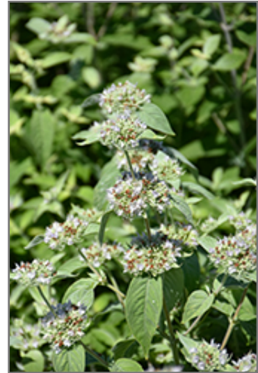
Short Toothed Mountain Mint flowers

Short Toothed Mountain Mint is an herbaceous perennial with an upright spreading habit of growth. Its relatively fine texture sets it apart from other garden plants with less refined foliage.