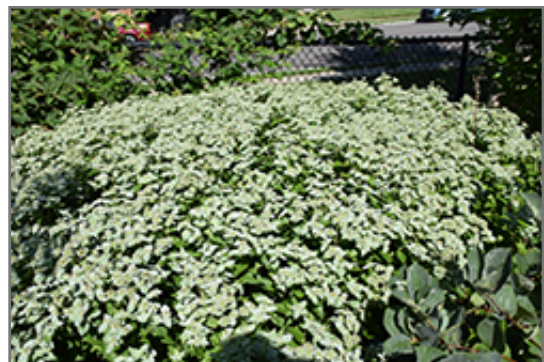
Short Toothed Mountain Mint in bloom