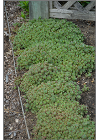
Lime Zinger Stonecrop

Lime Zinger Stonecrop will grow to be only 4 inches tall at maturity extending to 6 inches tall with the flowers, with a spread of 18 inches. When grown in masses or used as a bedding plant, individual plants should be spaced approximately 15 inches apart. Its foliage tends to remain low and dense right to the ground. It grows at a fast rate, and under ideal conditions can be expected to live for approximately 15 years. As an herbaceous perennial, this plant will usually die back to the crown each winter, and will regrow from the base each spring. Be careful not to disturb the crown in late winter when it may not be readily seen!