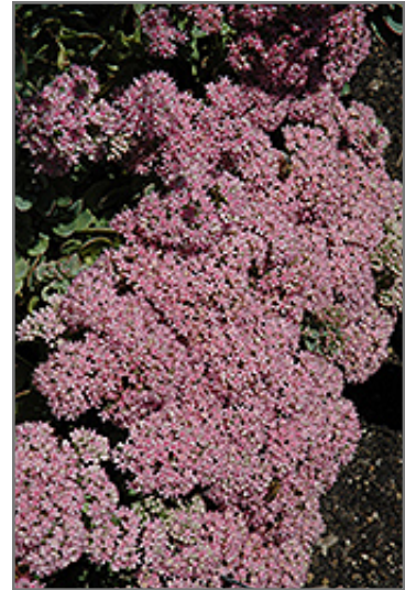
Lime Zinger Stonecrop flowers

This is a relatively low maintenance plant, and is best cleaned up in early spring before it resumes active growth for the season. It is a good choice for attracting bees and butterflies to your yard, but is not particularly attractive to deer who tend to leave it alone in favor of tastier treats. It has no significant negative characteristics.