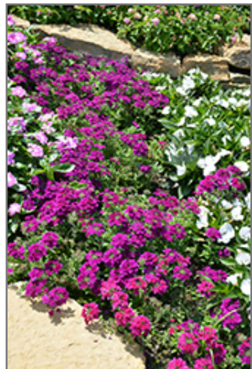
Superbena Royale Plum Wine Verbena in bloom