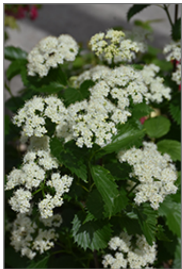
Blue Muffin Viburnum flowers