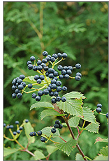
Blue Muffin Viburnum fruit

Blue Muffin Viburnum is recommended for the following landscape applications;