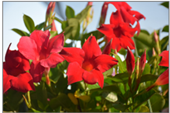
Sun Parasol Crimson Mandevilla flowers

This plant is native to the tropics and prefers growing in moist environments with evenly warm conditions all year round. In our climate, it is usually grown as an outdoor annual in the garden or in a container. If you want it to survive the winter, it can be brought in to the house and provided with special care, and then returned to the garden the following season. In its preferred tropical habitat, it can grow to be around 10 feet tall at maturity, with a spread of 24 inches. However, when grown as an annual or when overwintered indoors, it can be expected to perform differently, and its exact height and spread will depend on many factors; you may wish to consult with our experts as to how it might perform in your specific application and growing conditions.