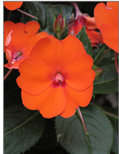
SunPatiens Compact Electric Orange New Guinea Impatiens flowers

This plant will require occasional maintenance and upkeep, and should not require much pruning, except when necessary, such as to remove dieback. It is a good choice for attracting bees and butterflies to your yard. It has no significant negative characteristics.