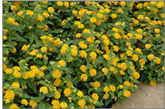
Little Lucky Pot Of Gold Lantana flowers

Little Lucky Pot Of Gold Lantana is recommended for the following landscape applications;