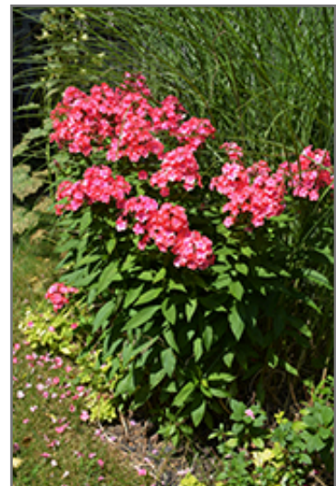
Flame Coral Garden Phlox in bloom