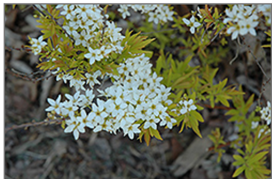
Mellow Yellow Spirea flowers