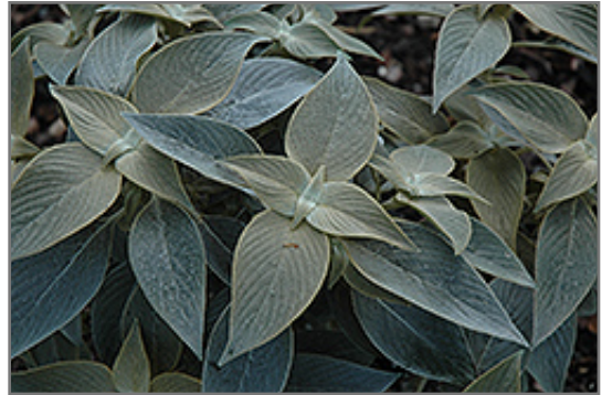
Persian Shield foliage