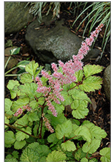
Amber Moon Chinese Astilbe flowers