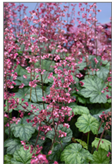
Berry Timeless Coral Bells flowers