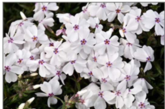
Amazing Grace Moss Phlox flowers