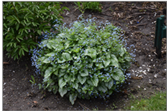
Sea Heart Bugloss in bloom

Sea Heart Bugloss will grow to be about 12 inches tall at maturity extending to 16 inches tall with the flowers, with a spread of 18 inches. When grown in masses or used as a bedding plant, individual plants should be spaced approximately 14 inches apart. It grows at a medium rate, and under ideal conditions can be expected to live for approximately 10 years. As an herbaceous perennial, this plant will usually die back to the crown each winter, and will regrow from the base each spring. Be careful not to disturb the crown in late winter when it may not be readily seen!