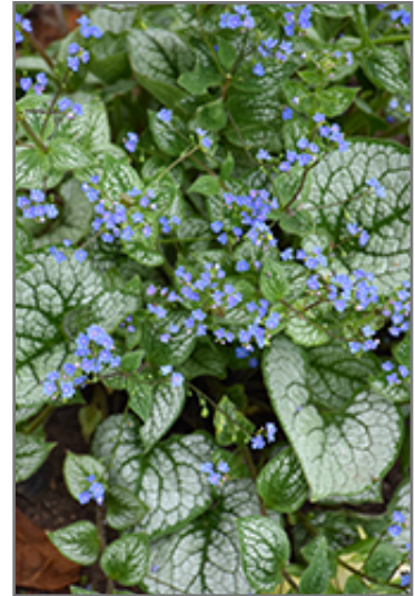
Sea Heart Bugloss flowers

Sea Heart Bugloss is recommended for the following landscape applications;