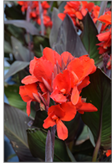
Cannova Bronze Scarlet Canna flowers

This plant is native to the tropics and prefers growing in moist environments with evenly warm conditions all year round. In our climate, it is usually grown as an outdoor annual in the garden or in a container. If you want it to survive the winter, it can be brought in to the house and provided with special care, and then returned to the garden the following season. In its preferred tropical habitat, it can grow to be around 4 feet tall at maturity, with a spread of 20 inches. However, when grown as an annual or when overwintered indoors, it can be expected to perform differently, and its exact height and spread will depend on many factors; you may wish to consult with our experts as to how it might perform in your specific application and growing conditions.