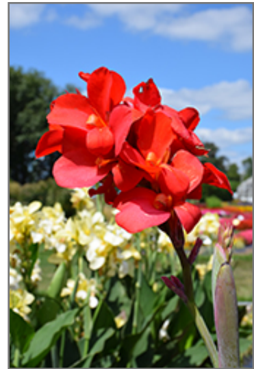
Cannova Bronze Scarlet Canna flowers

Cannova Bronze Scarlet Canna is a fine choice for the garden, but it is also a good selection for planting in outdoor pots and containers. With its upright habit of growth, it is best suited for use as a 'thriller' in the 'spiller-thriller-filler' container combination; plant it near the center of the pot, surrounded by smaller plants and those that spill over the edges. It is even sizeable enough that it can be grown alone in a suitable container. Note that when growing plants in outdoor containers and baskets, they may require more frequent waterings than they would in the yard or garden. Be aware that in our climate, most plants cannot be expected to survive the winter if left in containers outdoors, and this plant is no exception. Contact our experts for more information on how to protect it over the winter months.