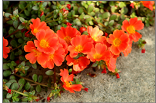
RioGrande Orange Portulaca flowers

RioGrande Orange Portulaca is recommended for the following landscape applications;