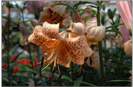
Splendens Tiger Lily flowers

Other Names: Lilium tigrinum , Improved Tiger Lily