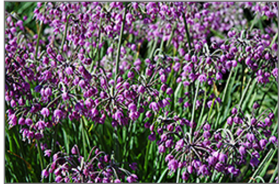
Nodding Onion flowers

Nodding Onion is recommended for the following landscape applications;