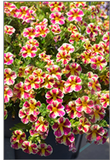
Superbells Holy Moly! Calibrachoa flowers

This plant will require occasional maintenance and upkeep. Trim off the flower heads after they fade and die to encourage more blooms late into the season. It is a good choice for attracting bees and hummingbirds to your yard, but is not particularly attractive to deer who tend to leave it alone in favor of tastier treats. It has no significant negative characteristics.