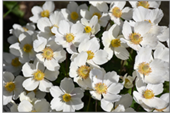
Windflower flowers