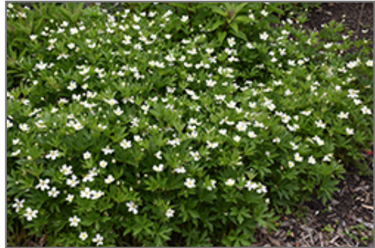
Windflower in bloom

Windflower will grow to be about 12 inches tall at maturity, with a spread of 18 inches. Its foliage tends to remain dense right to the ground, not requiring facer plants in front. It grows at a fast rate, and under ideal conditions can be expected to live for approximately 10 years. As an herbaceous perennial, this plant will usually die back to the crown each winter, and will regrow from the base each spring. Be careful not to disturb the crown in late winter when it may not be readily seen!