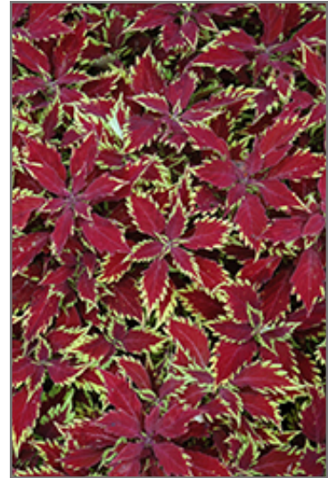
ColorBlaze Royale Apple Brandy Coleus foliage

ColorBlaze Royale Apple Brandy Coleus is recommended for the following landscape applications;