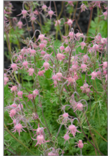
Prairie Smoke flowers