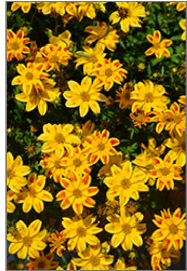
Beedance Red Stripe Bidens flowers

Beedance Red Stripe Bidens is recommended for the following landscape applications;