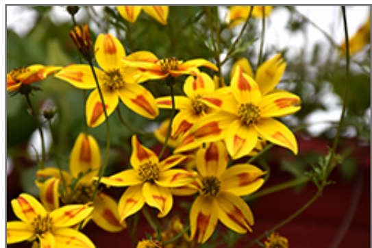
Beedance Red Stripe Bidens flowers