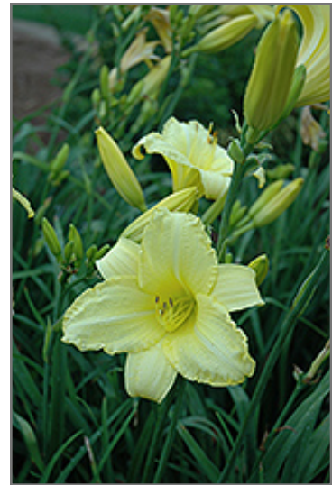
Happy Ever Appster Happy Returns Daylily flowers

Happy Ever Appster Happy Returns Daylily is recommended for the following landscape applications;