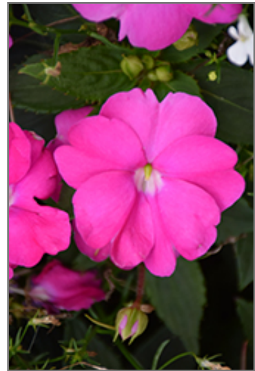
SunPatiens Compact Neon Pink New Guinea Impatiens flowers

This plant will require occasional maintenance and upkeep, and should not require much pruning, except when necessary, such as to remove dieback. It is a good choice for attracting bees and butterflies to your yard. It has no significant negative characteristics.