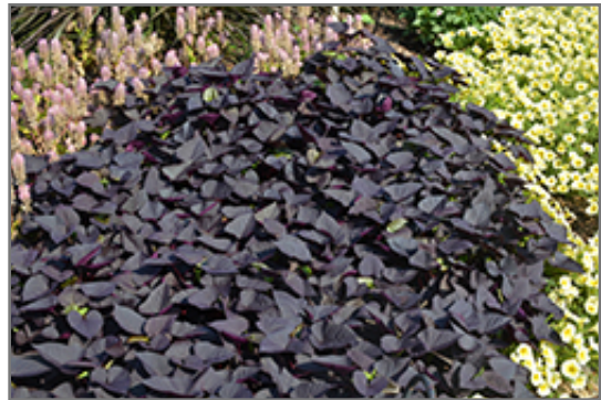
Sweet Caroline Sweetheart Jet Black Sweet Potato Vine

This is a relatively low maintenance plant. The flowers of this plant may actually detract from its ornamental features, so they can be removed as they appear. It has no significant negative characteristics.