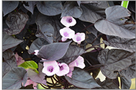
Sweet Caroline Sweetheart Jet Black Sweet Potato Vine flowers

Sweet Caroline Sweetheart Jet Black Sweet Potato Vine will grow to be about 12 inches tall at maturity, with a spread of 30 inches. Its foliage tends to remain dense right to the ground, not requiring facer plants in front. This fast-growing annual will normally live for one full growing season, needing replacement the following year.