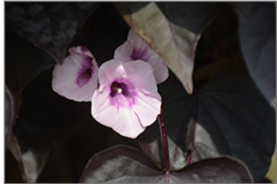
Sweet Caroline Sweetheart Jet Black Sweet Potato Vine flowers

Sweet Caroline Sweetheart Jet Black Sweet Potato Vine will grow to be about 12 inches tall at maturity, with a spread of 30 inches. Its foliage tends to remain dense right to the ground, not requiring facer plants in front. This fast-growing annual will normally live for one full growing season, needing replacement the following year.