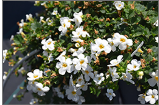
Snowstorm Snow Globe Bacopa flowers

Snowstorm Snow Globe Bacopa is recommended for the following landscape applications;