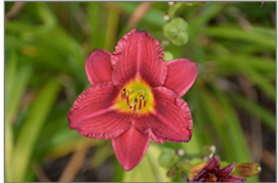
Pardon Me Daylily flowers