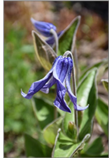
Blue Ribbons Bush Clematis flowers

Blue Ribbons Bush Clematis is recommended for the following landscape applications;