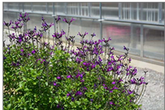
Vibe Ignition Purple Sage in bloom