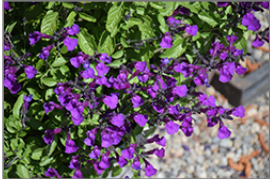
Vibe Ignition Purple Sage flowers