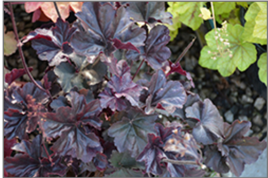
Obsidian Coral Bells foliage

Obsidian Coral Bells is recommended for the following landscape applications;