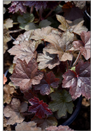
Palace Purple Coral Bells foliage

Palace Purple Coral Bells is recommended for the following landscape applications;