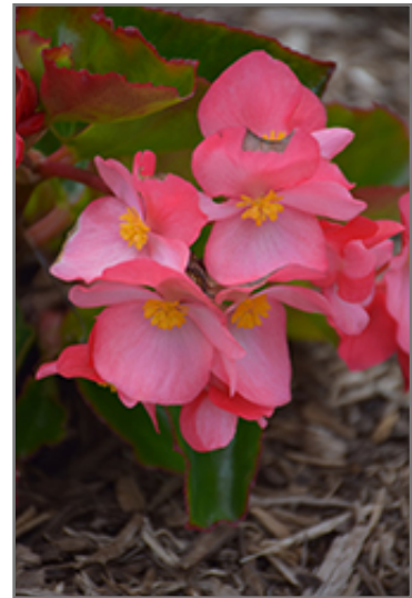
Megawatt Rose Green Leaf Begonia flowers

Megawatt Rose Green Leaf Begonia is an herbaceous annual with an upright spreading habit of growth. Its medium texture blends into the garden, but can always be balanced by a couple of finer or coarser plants for an effective composition.