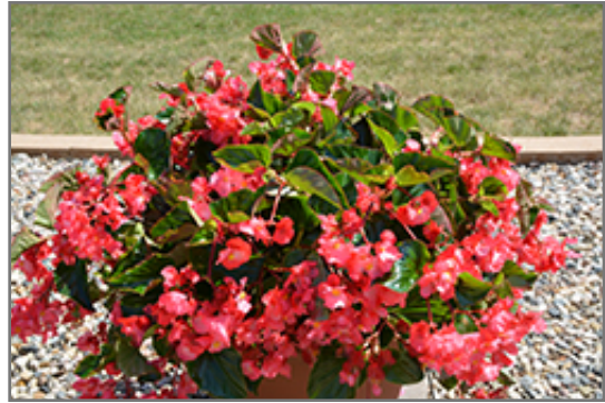
Megawatt Rose Green Leaf Begonia in bloom

Megawatt Rose Green Leaf Begonia is a fine choice for the garden, but it is also a good selection for planting in outdoor containers and hanging baskets. With its upright habit of growth, it is best suited for use as a 'thriller' in the 'spiller-thriller-filler' container combination; plant it near the center of the pot, surrounded by smaller plants and those that spill over the edges. It is even sizeable enough that it can be grown alone in a suitable container. Note that when growing plants in outdoor containers and baskets, they may require more frequent waterings than they would in the yard or garden.