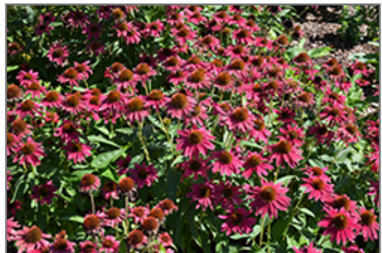
Sombrero Tres Amigos Coneflower in bloom