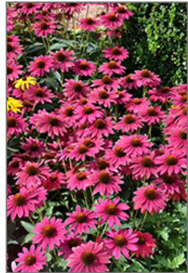
Sombrero Tres Amigos Coneflower flowers

Sombrero Tres Amigos Coneflower is a fine choice for the garden, but it is also a good selection for planting in outdoor pots and containers. With its upright habit of growth, it is best suited for use as a 'thriller' in the 'spiller-thriller-filler' container combination; plant it near the center of the pot, surrounded by smaller plants and those that spill over the edges. Note that when growing plants in outdoor containers and baskets, they may require more frequent waterings than they would in the yard or garden. Be aware that in our climate, most plants cannot be expected to survive the winter if left in containers outdoors, and this plant is no exception. Contact our experts for more information on how to protect it over the winter months.