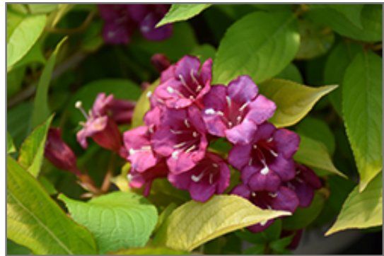
Golden Jackpot Weigela flowers

Golden Jackpot Weigela is recommended for the following landscape applications;