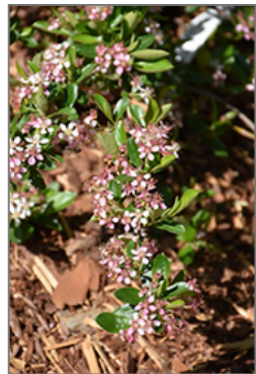
Ground Hug Aronia flowers