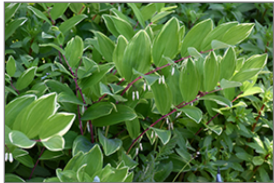
Variegated Solomon's Seal flowers