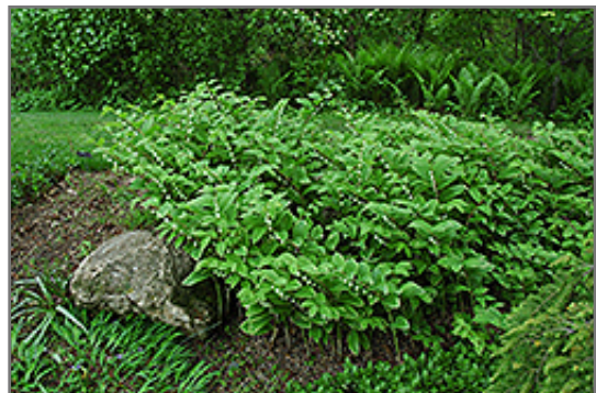
Variegated Solomon's Seal in bloom