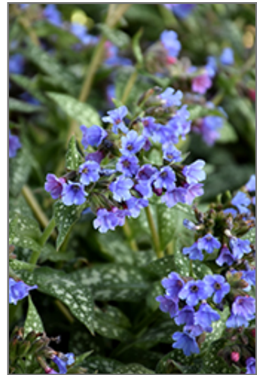
Trevi Fountain Lungwort flowers