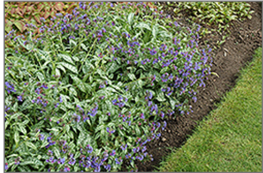
Trevi Fountain Lungwort in bloom

Trevi Fountain Lungwort will grow to be about 12 inches tall at maturity, with a spread of 18 inches. When grown in masses or used as a bedding plant, individual plants should be spaced approximately 15 inches apart. Its foliage tends to remain dense right to the ground, not requiring facer plants in front. It grows at a medium rate, and under ideal conditions can be expected to live for approximately 10 years. As an herbaceous perennial, this plant will usually die back to the crown each winter, and will regrow from the base each spring. Be careful not to disturb the crown in late winter when it may not be readily seen!