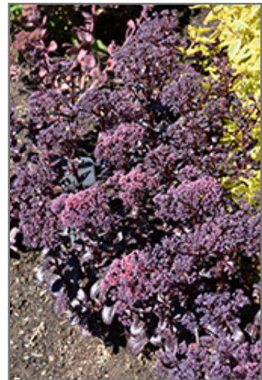
Dark Magic Stonecrop in bloom