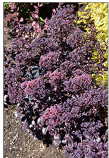
Dark Magic Stonecrop in bloom