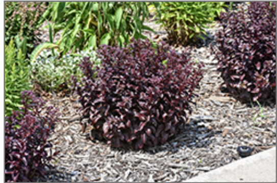
Dark Magic Stonecrop in bloom

Dark Magic Stonecrop will grow to be about 12 inches tall at maturity, with a spread of 20 inches. When grown in masses or used as a bedding plant, individual plants should be spaced approximately 16 inches apart. It grows at a fast rate, and under ideal conditions can be expected to live for approximately 15 years. As an herbaceous perennial, this plant will usually die back to the crown each winter, and will regrow from the base each spring. Be careful not to disturb the crown in late winter when it may not be readily seen!