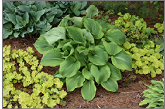
Twin Cities Hosta

Twin Cities Hosta is recommended for the following landscape applications;