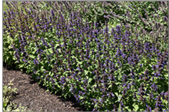
Neptune Catmint in bloom

Neptune Catmint is a fine choice for the garden, but it is also a good selection for planting in outdoor pots and containers. It is often used as a 'filler' in the 'spiller-thriller-filler' container combination, providing a mass of flowers against which the thriller plants stand out. Note that when growing plants in outdoor containers and baskets, they may require more frequent waterings than they would in the yard or garden. Be aware that in our climate, most plants cannot be expected to survive the winter if left in containers outdoors, and this plant is no exception. Contact our experts for more information on how to protect it over the winter months.