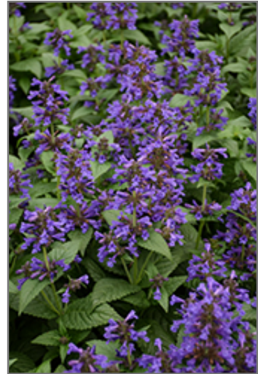
Neptune Catmint flowers

Neptune Catmint is a dense herbaceous perennial with a mounded form. Its relatively fine texture sets it apart from other garden plants with less refined foliage.