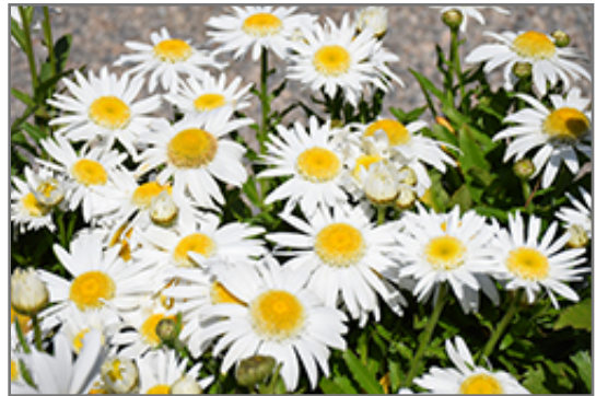
Carpet Angel Daisy flowers