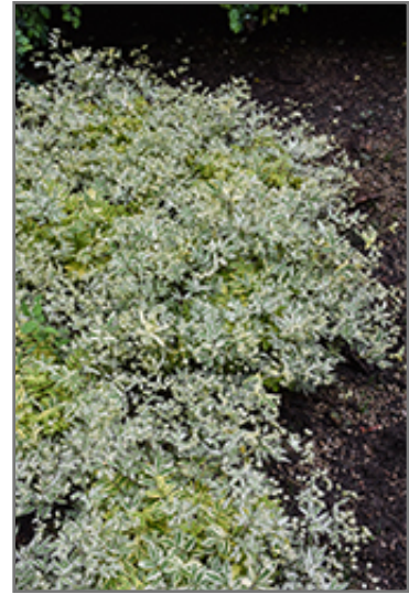
Golden Feathers Jacob's Ladder foliage

Golden Feathers Jacob's Ladder is recommended for the following landscape applications;