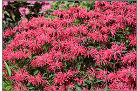
Upscale Red Velvet Beebalm flowers

Upscale Red Velvet Beebalm is an herbaceous perennial with a mounded form. Its medium texture blends into the garden, but can always be balanced by a couple of finer or coarser plants for an effective composition.