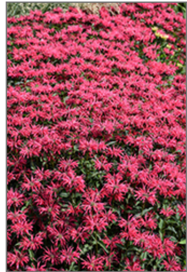
Upscale Red Velvet Beebalm flowers

Upscale Red Velvet Beebalm is a fine choice for the garden, but it is also a good selection for planting in outdoor pots and containers. Because of its height, it is often used as a 'thriller' in the 'spiller-thriller-filler' container combination; plant it near the center of the pot, surrounded by smaller plants and those that spill over the edges. It is even sizeable enough that it can be grown alone in a suitable container. Note that when growing plants in outdoor containers and baskets, they may require more frequent waterings than they would in the yard or garden. Be aware that in our climate, most plants cannot be expected to survive the winter if left in containers outdoors, and this plant is no exception. Contact our experts for more information on how to protect it over the winter months.