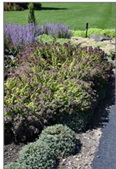
Drops of Jupiter Oregano in bloom