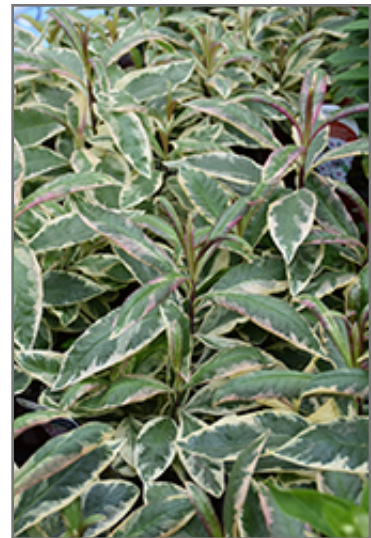
Olympus Garden Phlox foliage